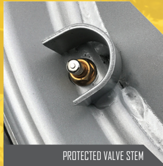
PROTECTED VALVE STEM

SEE TIRE SIZING SPECS ON THE REVERSE SIDE