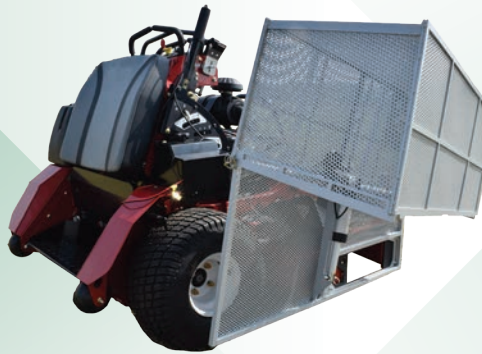
Stand On Mowers