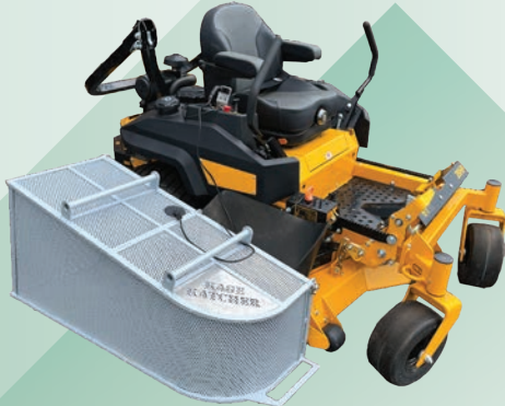
Zero Turn Mowers