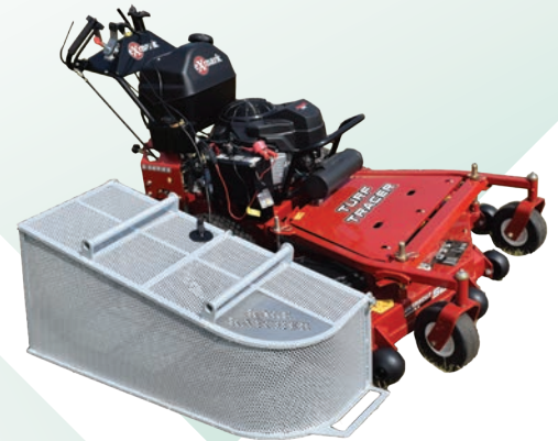
Walk Behind Mowers