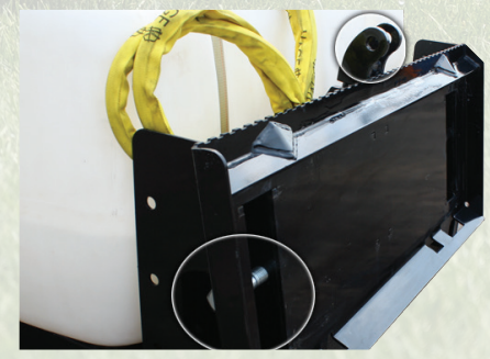
PATENTED 3-POINT SKID STEER ATTACHMENT