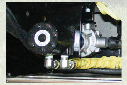
HYDRAULIC DRIVEN FILTERED PUMP